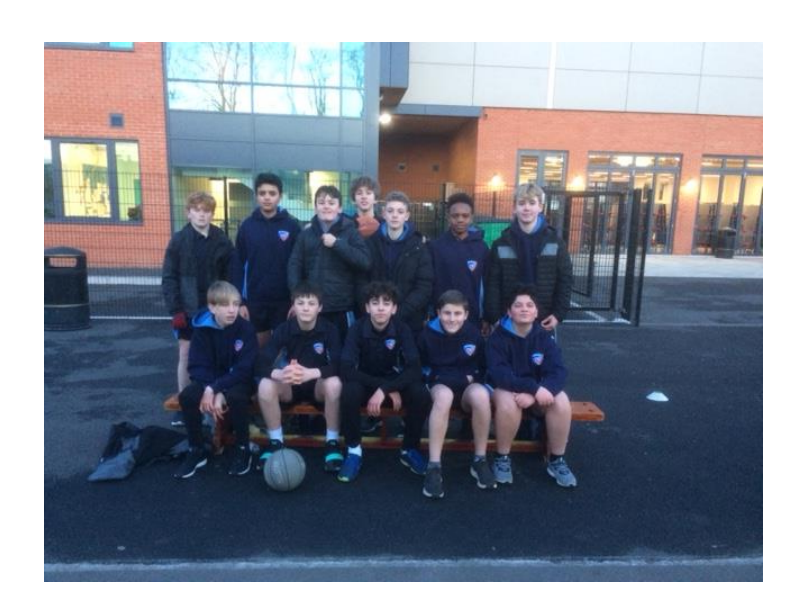
Well done to the Year 8/9 Basketball Team who were narrowly beaten by SSR 30 – 28 last week.