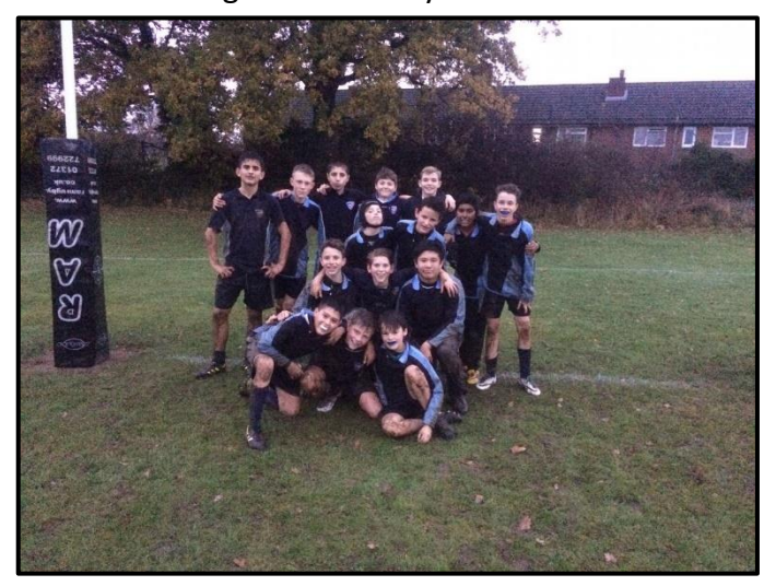
Hinchley Wood 5 – Turing House 15

Congratulations to the Year 8 Rugby team on a fantastic win against Hinchley Wood!