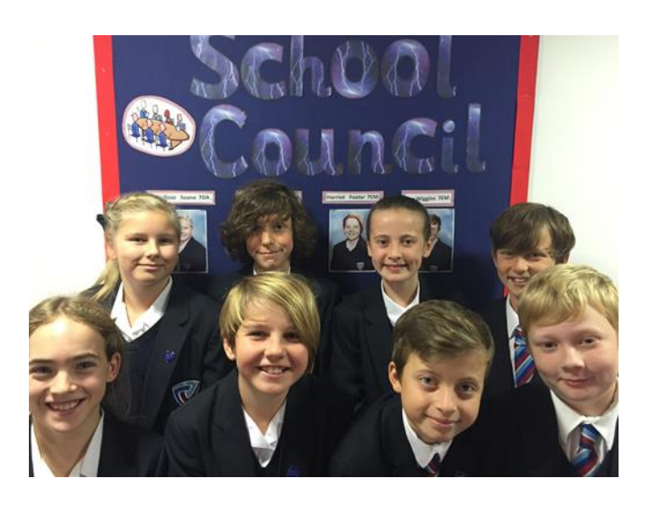
The Turing House School Council

Our School Council have now met on three occasions and have begun to shape some of the things we will be doing from now until Christmas. Agreed this week are to celebrate the National Christmas Jumper Day in December and have an Inter-form bake off/cake sale for Children in Need in November.