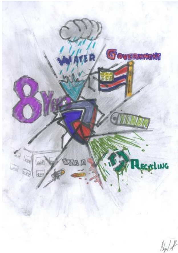
4 - By Nagul R