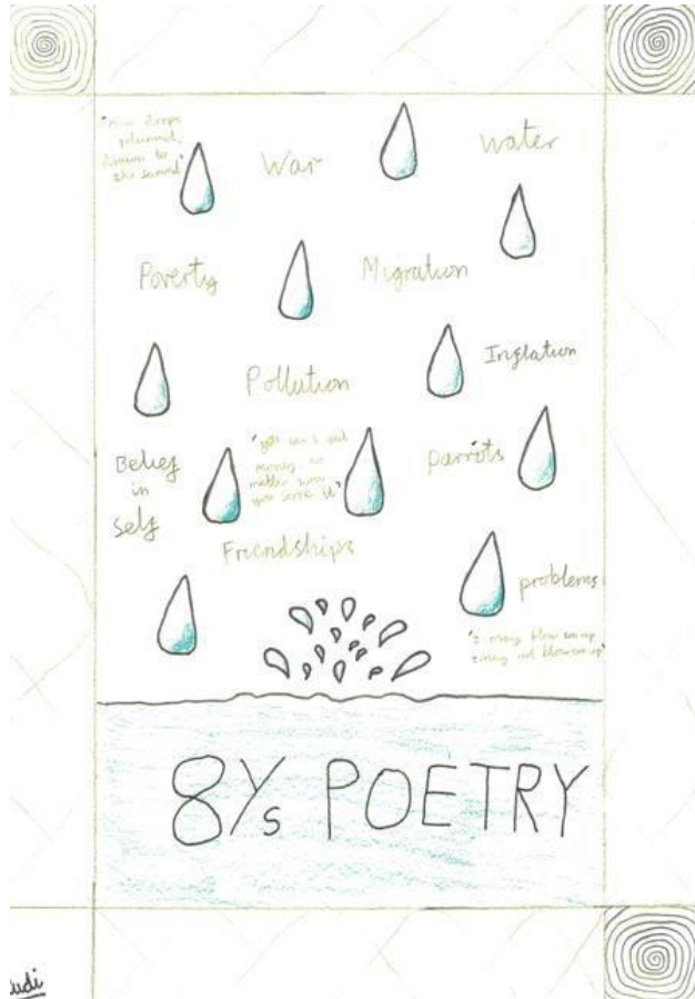
2 - By Rudi T