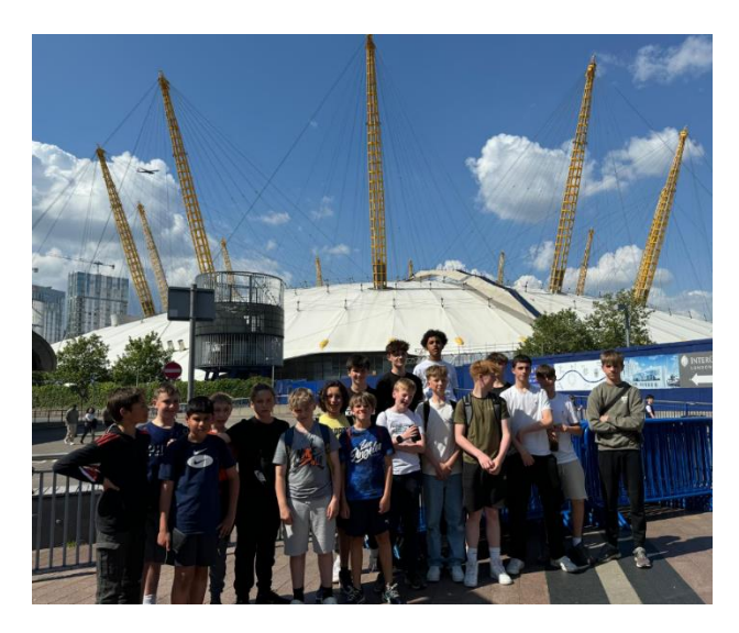
Year 7-9 Girls Flag Football Finals Day

Having won their pool with three impressive wins out of three games this term, the Year 7-9 girls were invited to attend and compete in a flag football finals