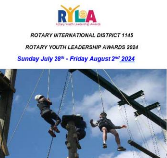
High Ashurst Outdoor Education Centre, Headley Lane, Mickleham, Dorking RHS 6DQ Operated for Rotary by Surrey Outdoor Learning & Development