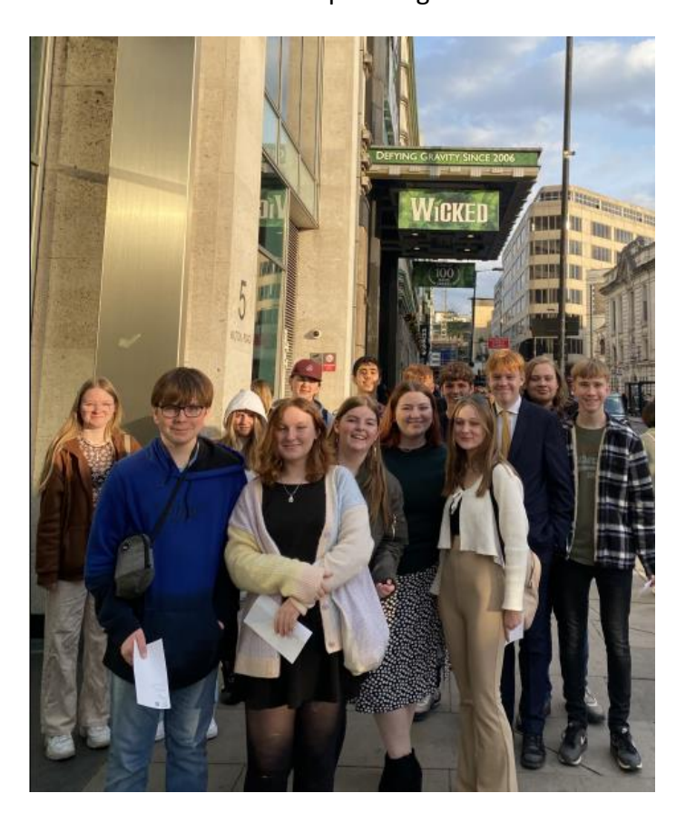
A pretty cool way of revising!

Some of our music students went to watch Wicked in the West End last week. GCSE Music students study the song 'Defying Gravity' from the show as part of their course and seeing the song in the context of the show was invaluable for their upcoming exam.