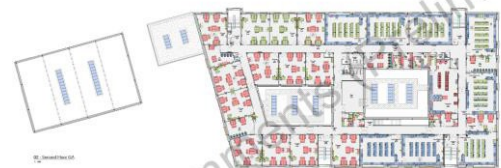
Plans from the second floor!

While the move is daunting it is also incredibly exciting. Your support on this matter will be greatly appreciated as staff will be working extremely hard to make the move a successful one. Wish us luck!